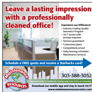
Custom ad design